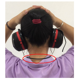
B.Neckband should be behind the neck.