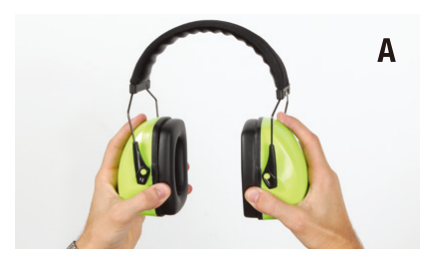
A Pull the cups outward and place over your ears so that the cushions fully enclose the ears and seal tightly against the head

This model of ear muff is to be worn over the head. When worn correctly, the head band of the earmuff is to rest on top of your head.